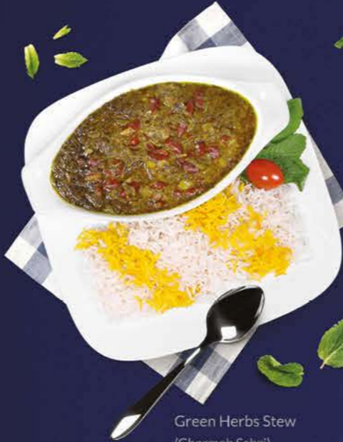
Green Herbs Stew (Ghormeh Sabzi)

(Gheymeh Bademjoon) Fine pieces of veal with split peas, eggplant and dried lime in a tasty tomato sauce served with rice