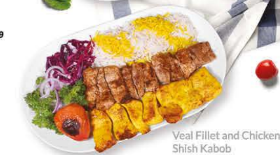
Veal Fillet and Chicken Shish Kabob