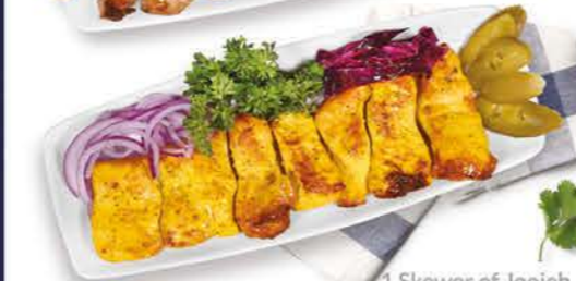
1 Skewer of Joojeh