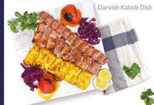
Darvish Kabob Dish

One skewer of koobideh and one skewer of lamb shish kabob served with rice and grilled tomato