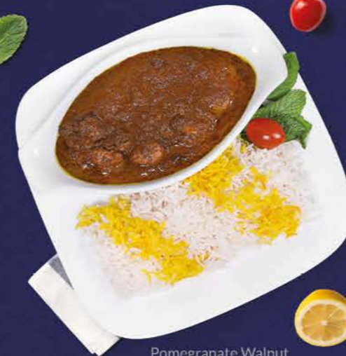
Pomegranate Walnut Stew (Fesenjoon)

(Ghormeh Sabzi) Petit veal brochette with fresh herbs, beans and dried lime served with rice